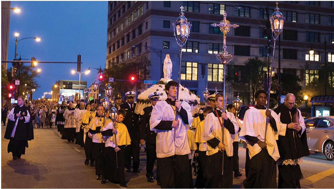
Thousands of people process behind the “Broken Mary” statue down Chicago Avenue after leaving St. John Cantius Church on May 31, 2019.