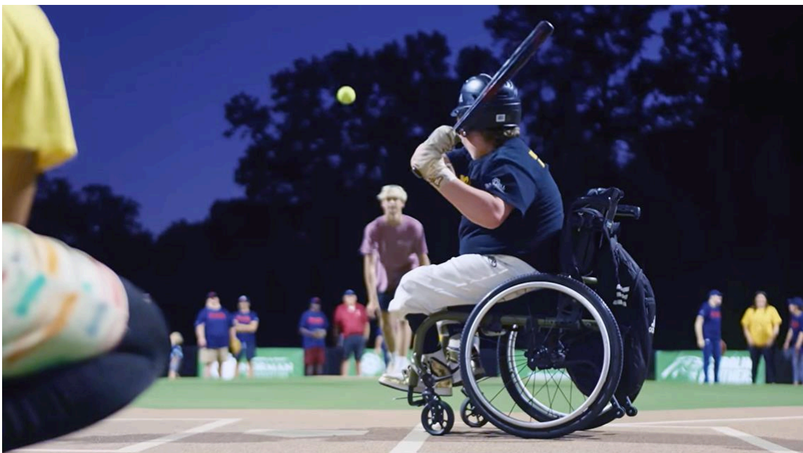
An athlete takes a swing from his wheelchair during a baseball game at Miracle Park in Rock Hill, S.C.